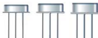
B3 BS B4